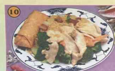
Chicken w. Broccoli Combo $12.00