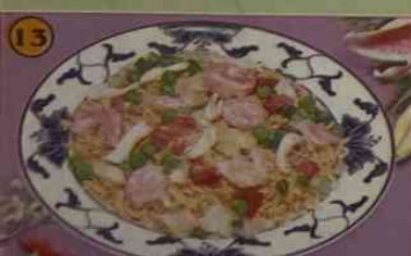
House Special Fried Rice $8.00

We Can Alter The Spicy According To Your Taste Or Cook Without Oil