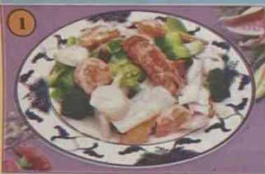
Club Seafood $17.50

OPEN 6 DAYS: Monday Closed Tue. - Thurs.: 11:30 am - 10:30 pm Fri. & Sat.: 11:30 am - 11:30 pm Sunday: 12:00 noon - 10:30 pm