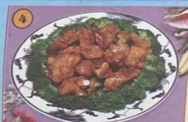
General Tso's Chicken $15.50