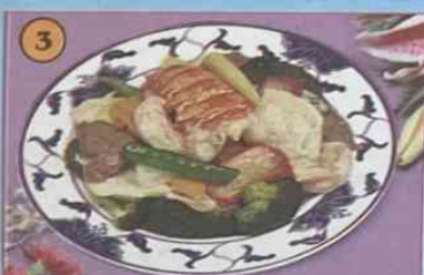
Happy Family $17.00