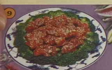
Sesame Chicken $15.50