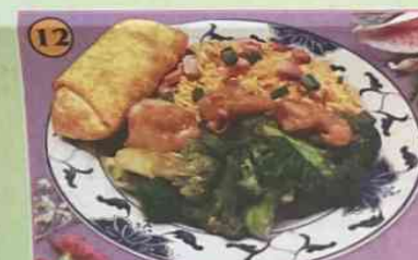
Shrimp w. Broccoli Combo $12.00