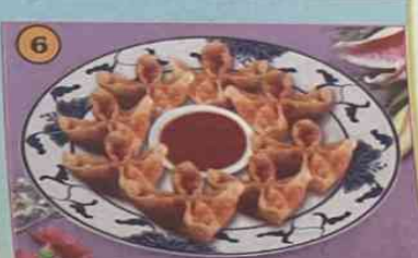
Fried Crab Wonton $7.00