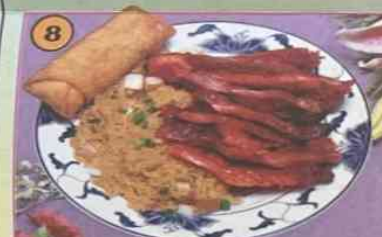
Boneless Spare Ribs Combo $13.00