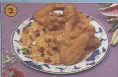
Fried Chicken Wings w. Roast Pork Fried Rice $10.50