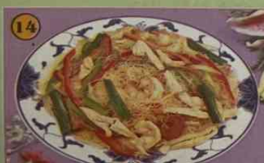
Singapore Chow Mei Fun $9.50