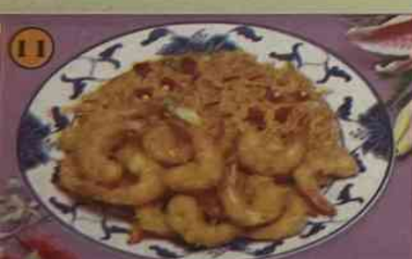
Fried Baby Shrimp w. Pork Fried Rice $10.50