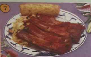
B.B.Q. Spare Ribs Combo $13.00