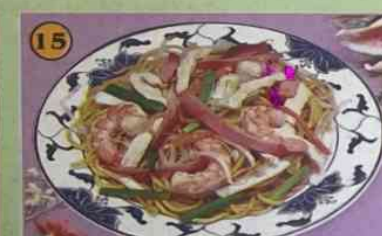
House Special Lo Mein $9.50