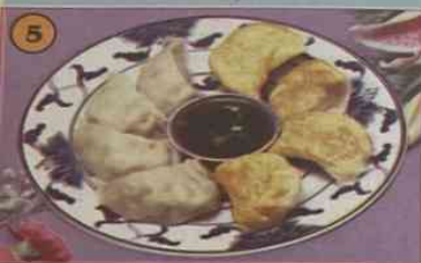
Fried or Steamed Dumplings (8) $8.00